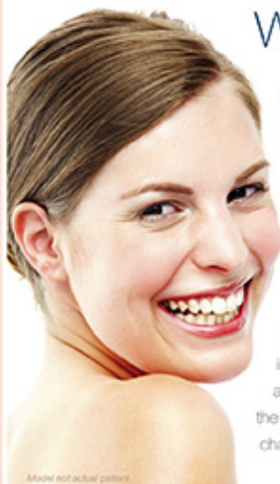
Model not actual patient

Experience minimal downtime in a "lunch-time" treatment and return to your busy lifestyle