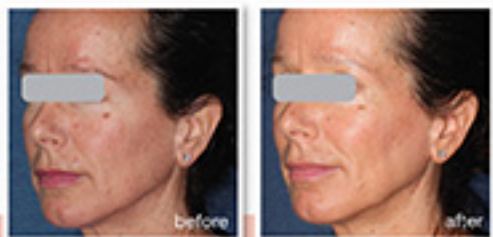
ResurFX™ for skin resurfacing