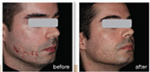
ResurFX™ for skin resurfacing

Haik Humble Laser Center 1804 N 7th Street West Monroe, LA 71291