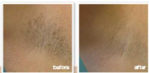
Armpits, one year follow-up post 5 treatments