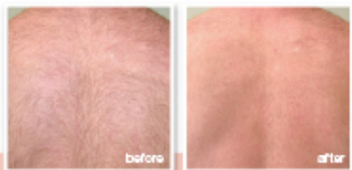
Back, 4 month follow-up post 4 treatments